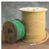
EBAD Explosive ordnance disposal & demolition