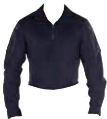
MEN'S DEFENDER SHIRT