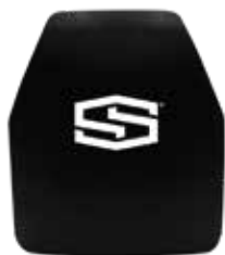
SHOTSTOP BALLISTIC PLATES