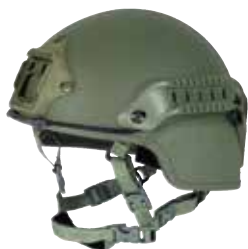
NP LASA AC914 FULL CUT BALLISTIC