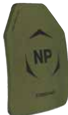
NP AEROSPACE LASA LWA III+ C06 LIGHTWEIGHT BUOYANT HARD ARMOUR