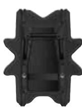
NP LASA TACTICAL BALLISTIC SHIELD SMALL