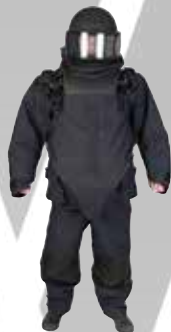
NP AEROSPACE 4020 ELITE SUIT Protectin bomb disposal technicians