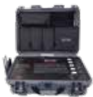
BASE CAMP CONNECT BCC-NEXT