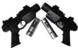
AERIAL BURST DISTRACTION ROUND