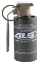
ALS 4140 DIVERSIONARY DEVICE BODY