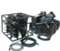
ASPEN WATER SEA WATER SYSTEM