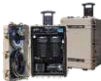
ASPEN WATER FRESH WATER SYSTEM