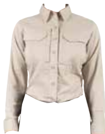
WOMEN'S V2 TACTICAL LONG SLEEVE SHIRT