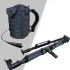
LIBERVIT DOOR-RAIDER LIGHT B HYDRAULIC DOOR OPENER