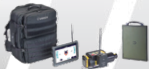
VIDISCO GUARDIAN 7