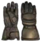
TITAN TACTICAL PUBLIC ORDER GLOVE