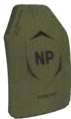
NP AEROSPACE LASA LWA III+ 109 IC06 ALUMINA HARD ARMOUR PLATE