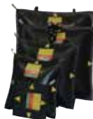
LIBERVIT LIFTING BAG