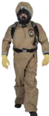
KAPPLER DURACHEM 500