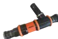
LIBERVIT HYDRAULIC JACKS