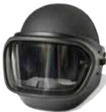
NP AEROSPACE EOD HELMET