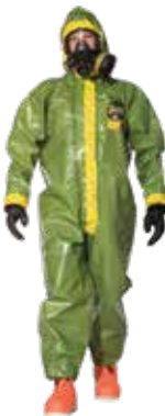
KAPPLER ZYTRON 400