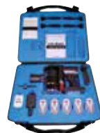
IDENTA AREOCHAMBER KIT

PROTECOP Notre mission : votre protection