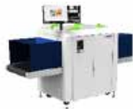
VOTI XR3D-60 BAGGAGE SCANNER