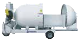
DYNASAFE DYNASEALR E SERIES