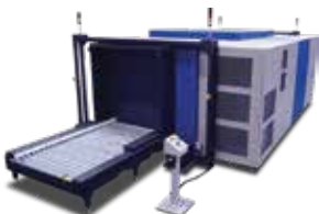
ASTROPHYSICS MULTI-VIEW CT