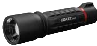
COAST XP11R FLASHLIGHT