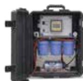
MUCH MORE WATER BLUEBOX 30 PRO