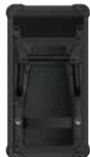
NP LASA TACTICAL BALLISTIC SHIELD SHORT