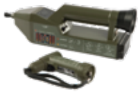
RAID M 100 HANDHELD CHEMICAL DETECTOR