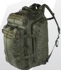
FIRST TACTICAL TACTIX 3-DAY PLUS BACKPACK 62 L