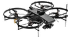
LEMUR S TACTICAL DRONE