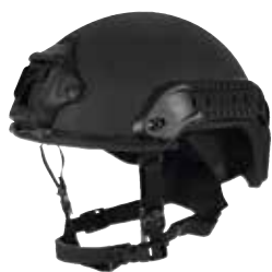
NP LASA AC915 HIGH CUT BALLISTIC