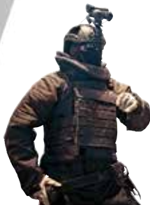
NP AEROSPACE 4320 ELITE SUIT for bomb search and breaching