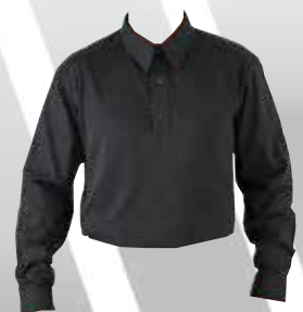
MEN'S V2 PRO PERFORMANCE SHIRT