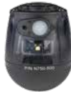
FOXFURY TACTICAL ELECTRONIC DISTRACTION DEVICE