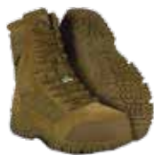
ALTAMA FOXHOUND SR 8" WP SAFETY CSA