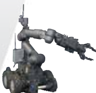
PERATON ANDROS™ FX.