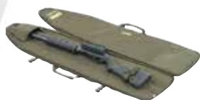
FIRST TACTICAL RIFLE SLEEVE 42 INCH