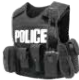
DUCKBILL LAW BELTS AND POUCHES