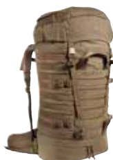
TASMANIAN TIGER TT FIELD PACK MKII