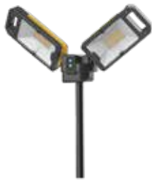
NIGHT SEARCHER TOWER PRO 5K