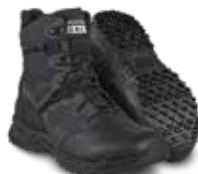
ORIGINAL S.W.A.T. ALPHA DURY 6 POLISH- ABLE TOE SZ WP