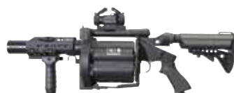
LESS-LETHAL TACTICAL LAUNCHER 40mm GRENADE LAUNCHER