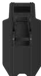
NP LASA TACTICAL BALLISTIC SHIELD LARGE