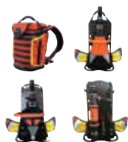
LIBERVIT SEARCH AND RESCUE KIT