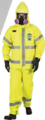
KAPPLER DURACHEM 200